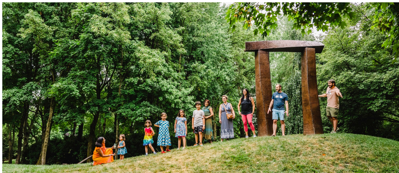
Cover: James Surls, Standing Vase with Five Flowers , 2011, bronze, stainless steel, 180 x 84 x 84 inches, Grounds For Sculpture, Gift of The Seward Johnson Atelier, © Artist or Artist's Estate; Emilie Benes Brzezinski, Lintel , 1993, bronze, 128 x 117 x 28 inches, Grounds For Sculpture, Gift of The Seward Johnson Atelier