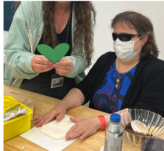
DBCAN Art Workshop

For the mission of the GFS Education Department, the accessibility of sculpture to all our visitors serves as a testament to the ongoing legacy and impact of our founder and artist Seward Johnson. Thanks to his vision, the experiences we can build at GFS are limited only by our own imaginations and expressions of love for all in our community.