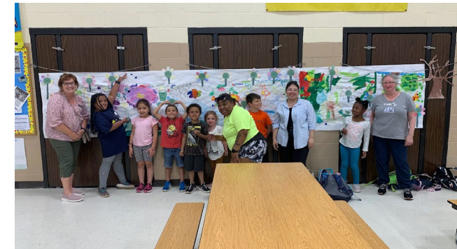
Hamilton YMCA Group

Recent funding from the John Ben Snow Memorial Trust expands the frequency and depth of GFS' afterschool programs for students in the Trenton and Hamilton area through our established partnerships with Hamilton YMCA, HomeWorks Trenton, and The Father Center of NJ. Held at GFS and other offsite locations, these collaboratively developed programs explore a variety of art-based concepts through a STEAM-based curriculum and aim to build participants' socio-emotional well-being and leadership skills.