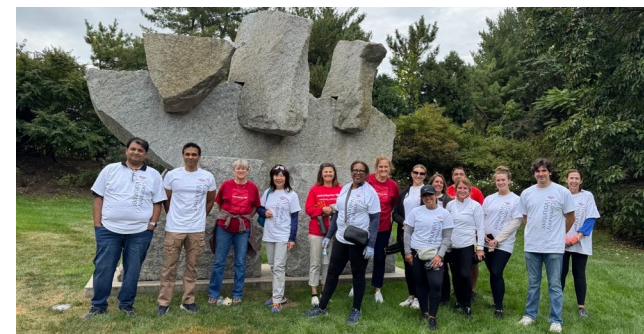
Bank of America

Bank of America volunteers helped to clean up the grounds near the Gazebo. They removed vines and trimmed shrubs to help our plants continue to grow and thrive.