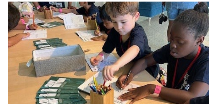
Trenton Children's Chorus

Part of supporter benefits of the Slow Motion exhibition is the underwriting of access for community youth groups to visit the exhibition at no cost. The visit includes an introduction and tour of the exhibitions led by our skilled guides, as well as time to create in the Public Engagement Space. 105 young community members were able to visit this exhibition in 2024, including Capital Harmony Works Trenton Children's Chorus and multiple RISE Summer Camp groups through this program.