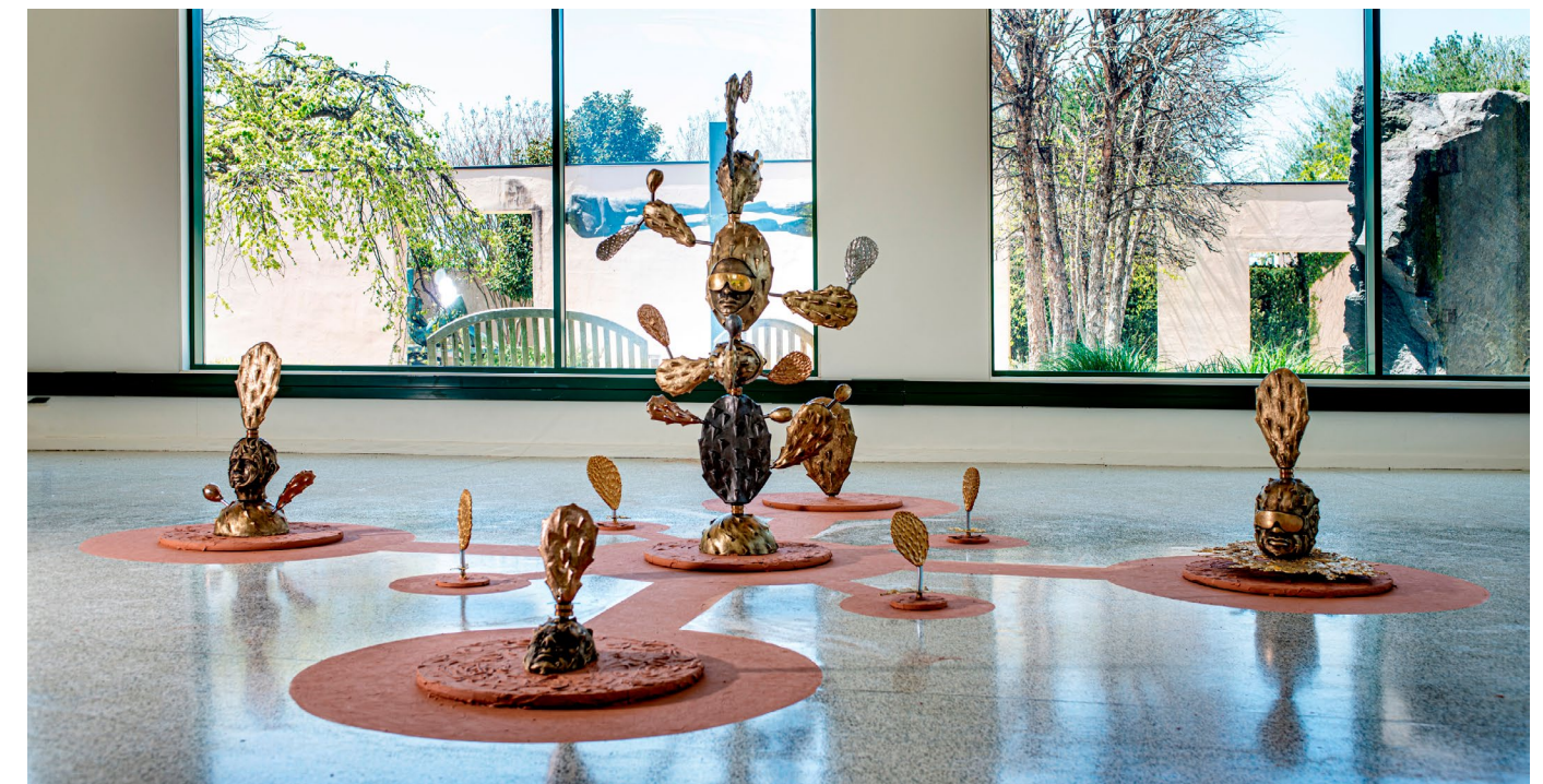
Salvador Jiménez-Flores, La vida cósmica de un nuevo mundo que está por venir / The Cosmic Life of a New World That Is Yet To Come , 2022, brass, cast iron, rose gold plating, brass hose, and clay slip, 180 x 180 inches, Courtesy of the Artist, photo: Ken Ek

For the exhibition at GFS, Jiménez-Flores will recontextualize existing work and create new work, including a new cast bronze sculpture that will be on view outdoors. A motif that Jiménez-Flores has often explored in his work in both clay and metal, is a hybridization of portraits and plant-life, often combining his face and the structure of a cactus or nopal.