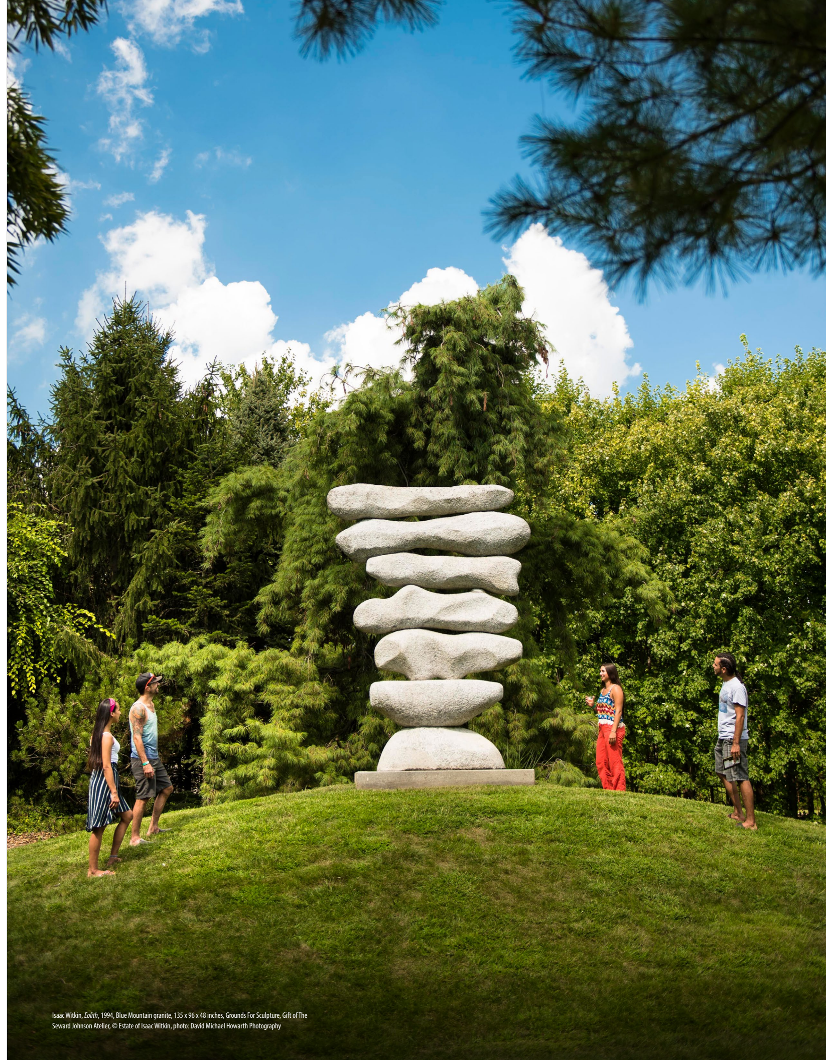
Isaac Witkin, Enlith , 1994, Blue Mountain granite, 135 x 96 x 48 inches, Grounds For Sculpture, Gift of The Seward Johnson Atelier, © Estate of Isaac Witkin